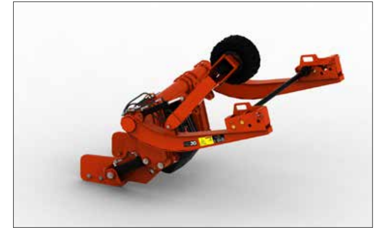
RC30 (REEL CARRIER)