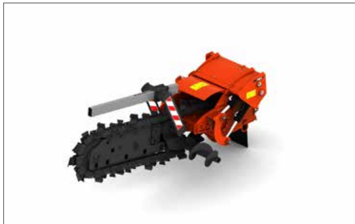
CT120H (HYD. CENTERLINE TRENCHER)