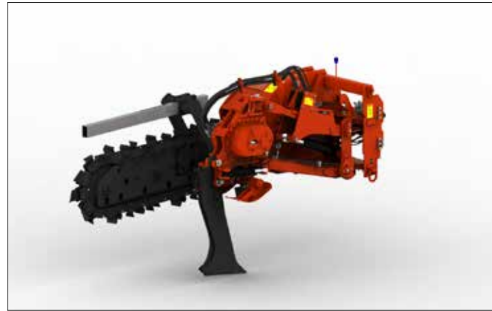
PT120Q (QUAD TRENCHER PLOW)