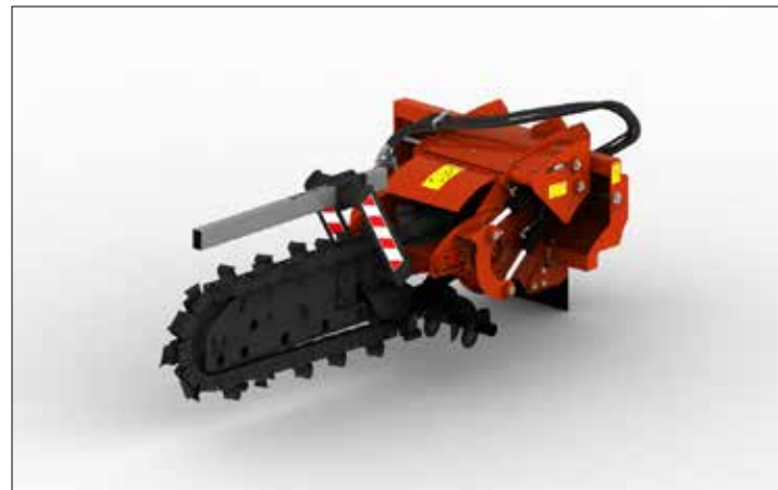
ST120H (HYD. SLIDING TRENCHER)